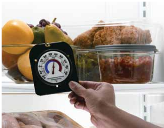
If the power stays out for a prolonged period, there are a few ways to aid your refrigerator and freezer in the fight to keep things cold.

If the power stays out for a prolonged period, there are a few ways to aid your refrigerator and freezer