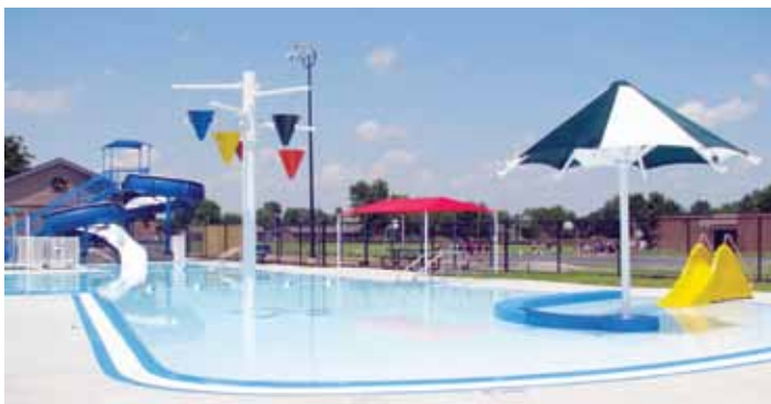
Splash Zone Aquatic Center opened this summer in Neodesha.

The bathhouse features amenities includ-