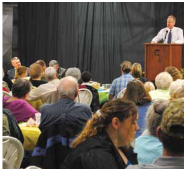
Kansas agriculture has a "story to tell that we can be proud