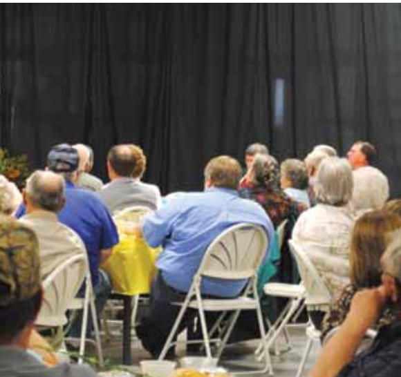
of" Congressman Jerry Moran told Radiant members.