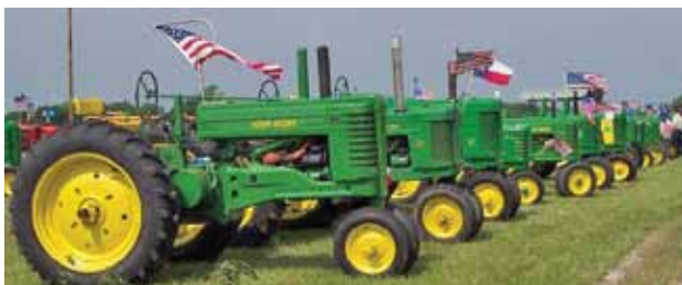
John Deere tractors at the 2009 show.

If you like to talk, work on, or look at tractors, old machinery or things from the past, check out the club's Web site at www.cvapa.com and consider joining.