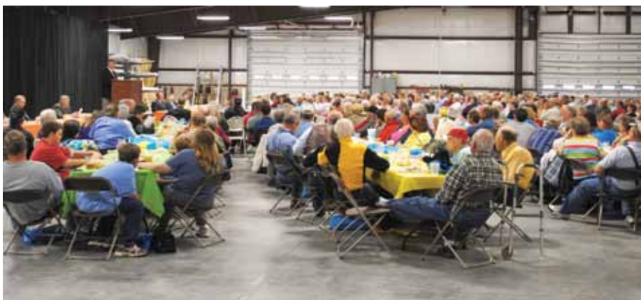
Over 430 members and guests attended the 2010 Annual Meeting.