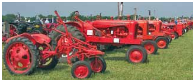
On June 4-6, 2010, the Pioneer Days feature tractor will be the Allis Chalmers.

The 17th Annual Tractor, Flea Market and Engine Show will be held June 4-6. On June 3, a trail drive from Dewey, OK, will bring 12-30 tractors up Hwy-75 to the 40 acres north of Caney. The theme of the event this